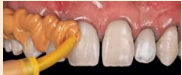
Fig 7c Insertion of the light-body impression material after removal of the deflection cord.

With the aid of a microbrush, silane (a chemical coupling agent) was applied to the inner surfaces of the ceramic restorations and left for 1 minute (Fig 9).