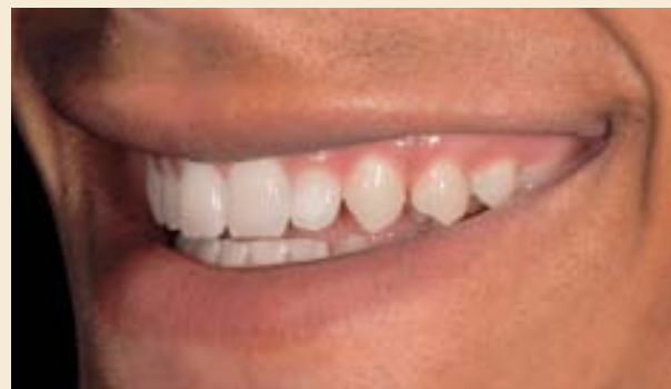
Figs 2a to 2c Preoperative extraoral views of patient 1. (a) Note the high maxillary posterior smile line and low anterior smile line. Also observe the lack of parallelism between the incisal edges of the maxillary anterior teeth and the lower lip. (b and c) Lateral views showing how the maxillary posterior smile line stands out, revealing more than 3 mm of gingival exposure.