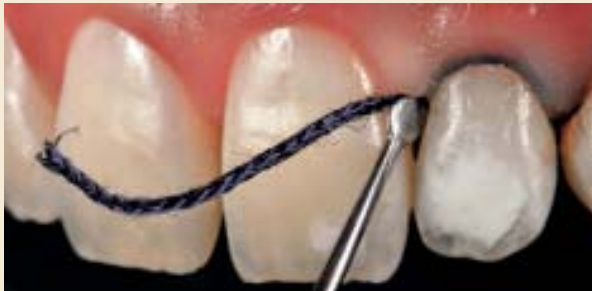
Fig 7a Impression taking. A small-diameter compression cord was placed in the bottom of the sulcus of each tooth.