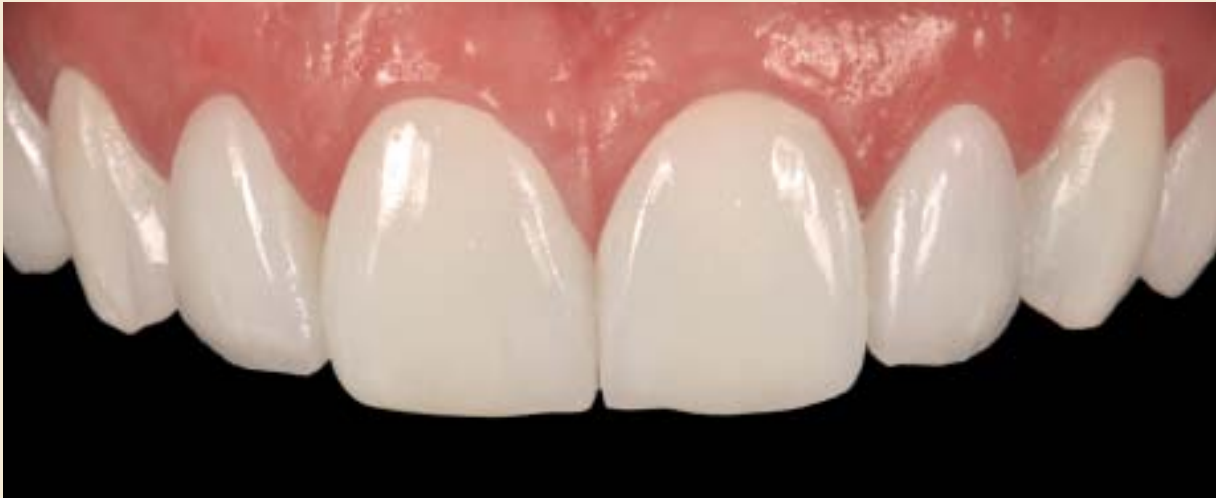
Fig 13 Intraoral view of patient 2 immediately after luting.