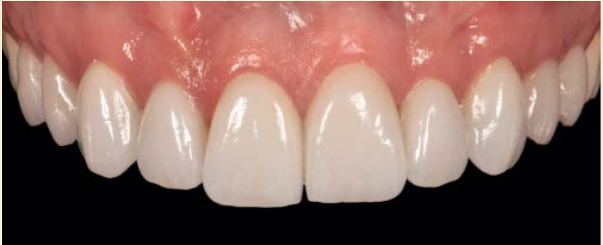
Fig 11 Intraoral view of patient 1 immediately after luting.