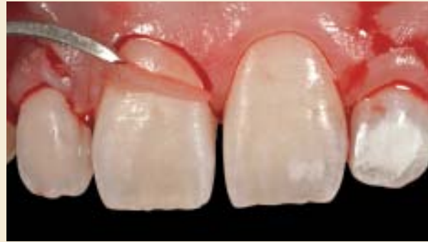
Figs 5c and 5d Esthetic gingivectomy using the flapless technique. After determining the incision outline using the direct mock-up, the gingival collars were removed.