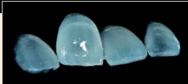
Fig 9 Surface treatment of the restorations using 9% hydrofluoric acid and silane coupling agent.