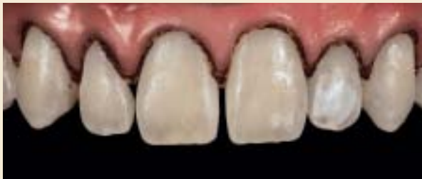
Fig 7b A more superficial, thicker, and continuous deflection cord was inserted in the entrance of the sulcus of all teeth.