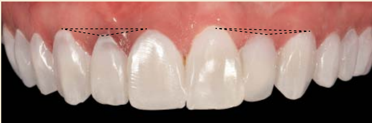
Fig 5b Preoperative mock-up. Although the zenith of the maxillary right central incisor was located slightly more apical than the left central incisor, this discrepancy was disregarded due to the low smile line.

A one-step, double-mix impression technique was carried out. The deflection cord was removed from the teeth. Due to the viscoelastic behavior of the gingival sulcus, it remained deflected after removing the cord. It is important to emphasize that the deflection cord must be wet during removal so that it does not attach to the inner walls of the gingival sulcus, which can lead to bleeding. After removing the deflection cord, the gingival sulcus was air dried, and the light-body impression material was inserted throughout the gingival sulcus