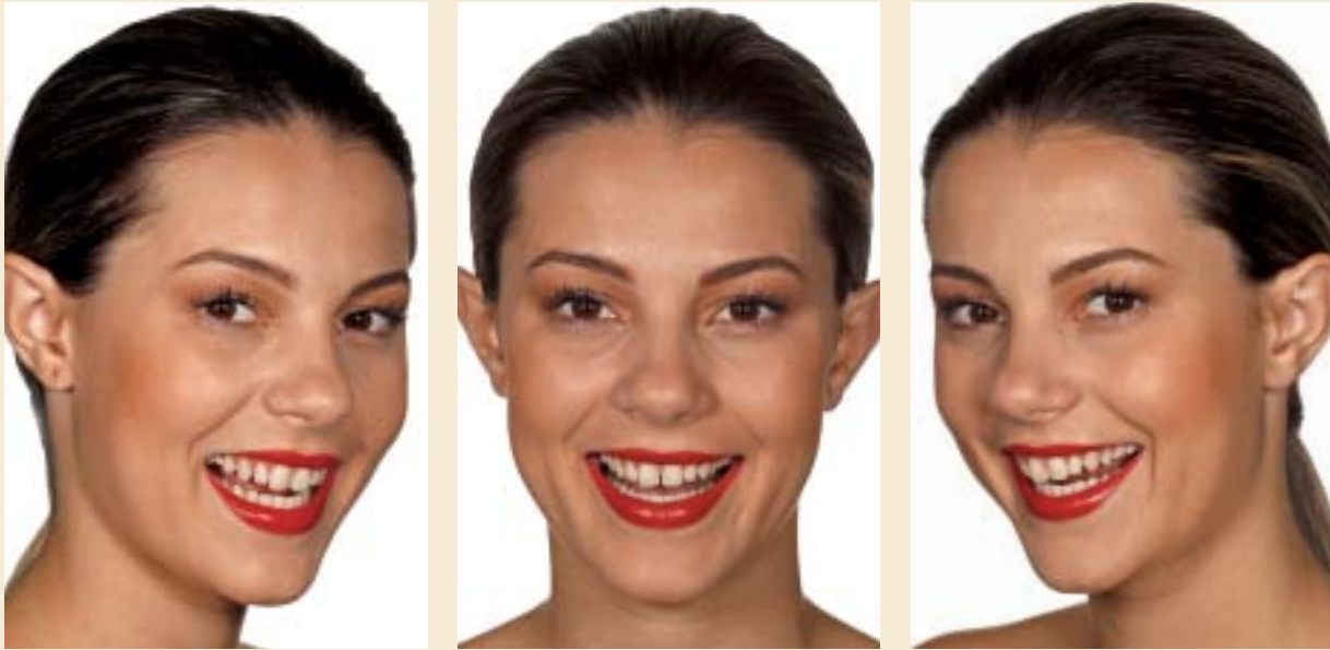
Figs 3a to 3c Preoperative facial views of patient 2.