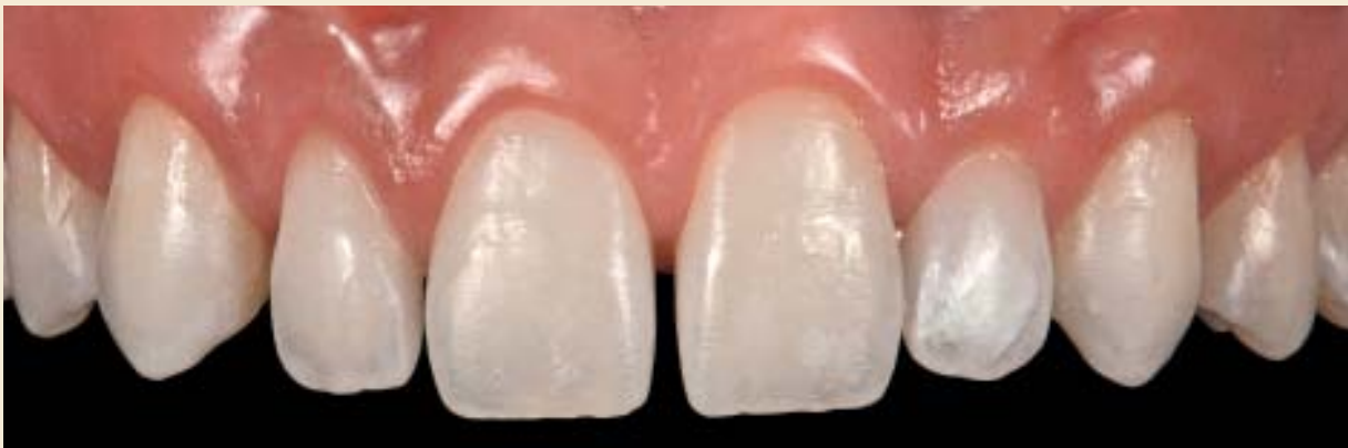
Fig 5e Postoperative view 90 days after the gingivectomy.

the luting procedures, try-in of the final restorations was carried out. The teeth were cleaned with pumice and dried. Transparent try-in paste (Variolink II Try In, Ivoclar Vivadent) was applied, and any excess was removed with a spatula. The adaptation of the restorations was checked with a probe, and the patient used a mirror to assess the esthetic features of the treatment.