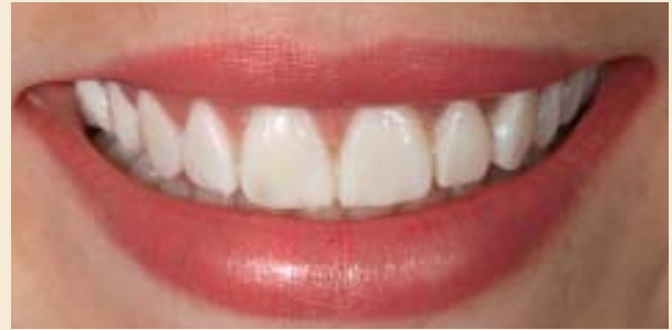
Figs 6a and 6b Postsurgery mock-up for (a) patient 1 and (b) patient 2.