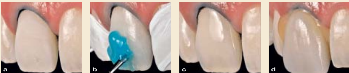
Figs 10a to 10d Luting procedures: (a) relative isolation with compression cord; (b) 35% phosphoric acid etching; (c) application of the unpolymerized adhesive; (d) placement of the noninvasive porcelain restoration.

(Fig 10c). Meanwhile, a coat of the adhesive (Excite DSC) was applied to the inner walls of the restorations, which were then loaded with the transpar-