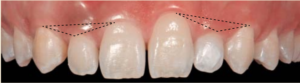
Fig 5a The interaction of the gingival contour and zenith creates imaginary lines that form a triangle ( dotted lines ). Note the discrepancy in gingival levels between both lateral incisors and their neighboring teeth as well as the height mismatch of the zeniths of the central incisors and canines.