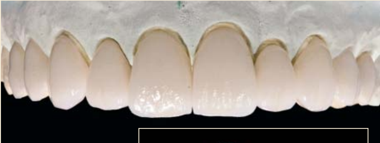
Figs 8a and 8b Noninvasive porcelain veneers (e.max, Ivoclar Vivadent).