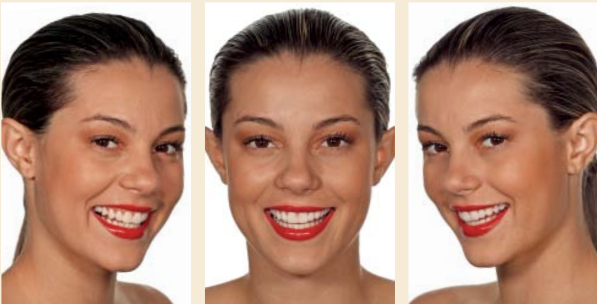
Figs 14a to 14c Final facial views of patient 2.

was then removed using dental pincers, and excess resin cement was chipped off with a no. 12 surgical blade. Refined finishing and polishing were performed at a subsequent session. The final re-